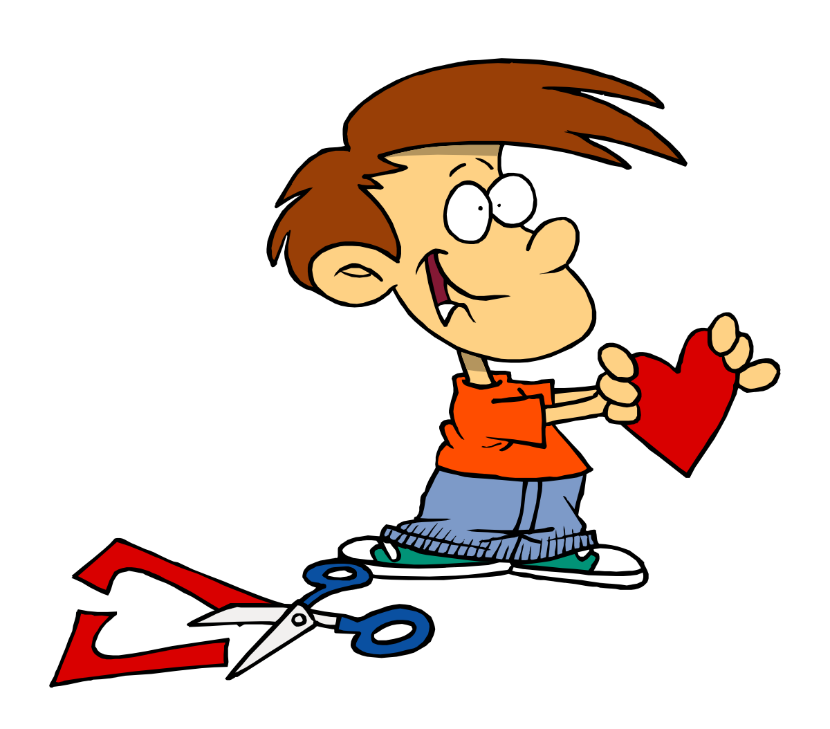
So I will be happy again.