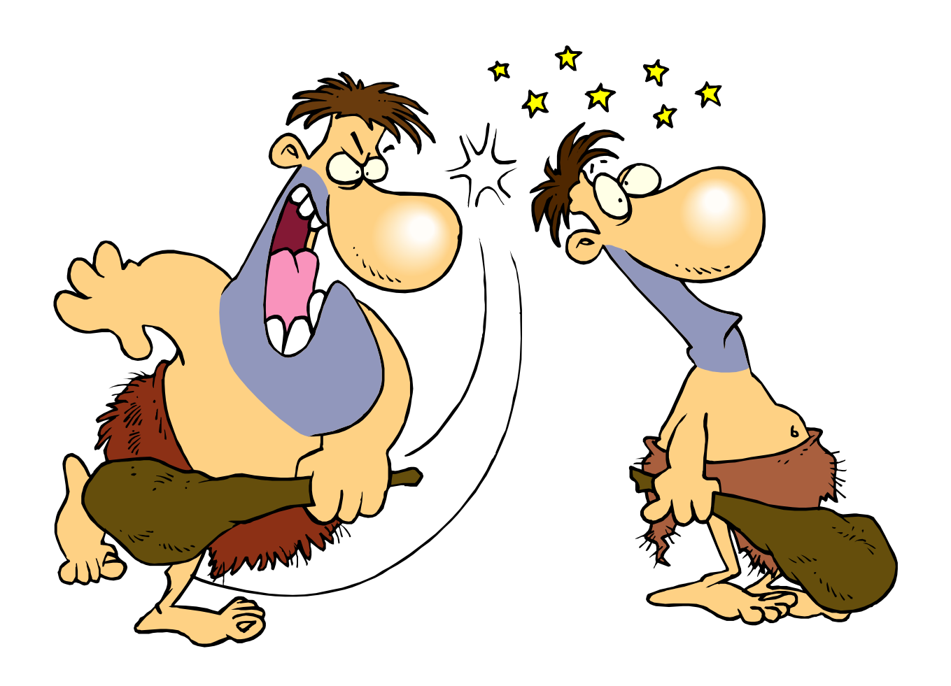
Some days I play nice, but other days I am mean.