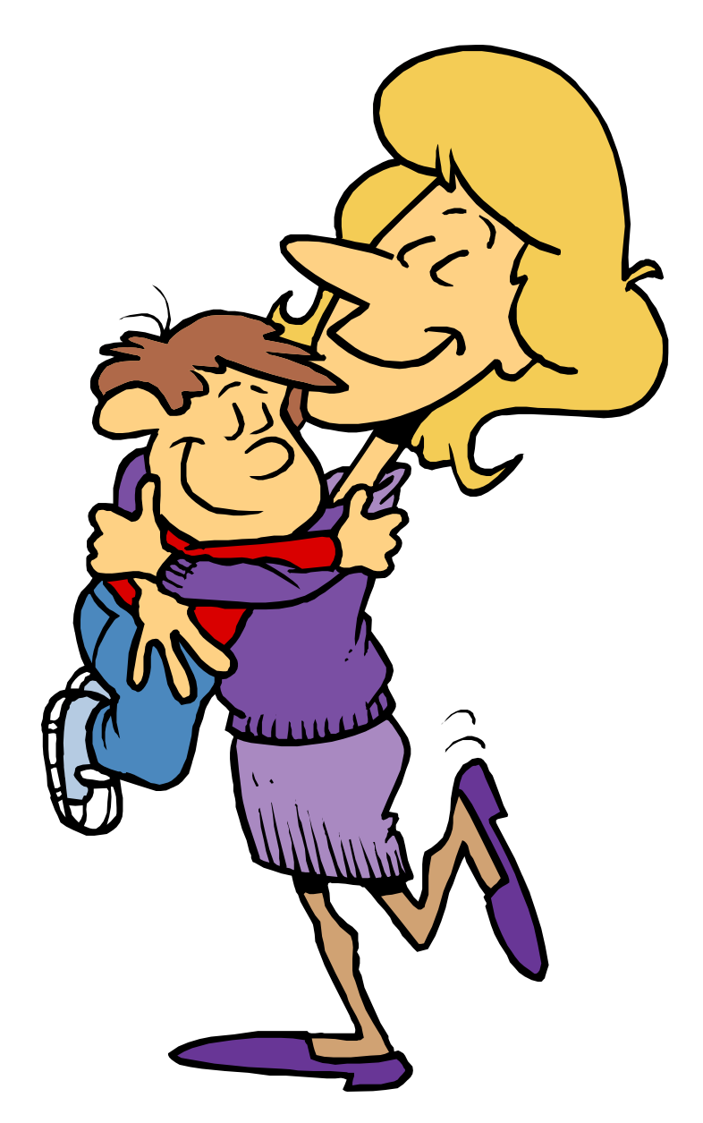
And I want my other days to be happy days too!